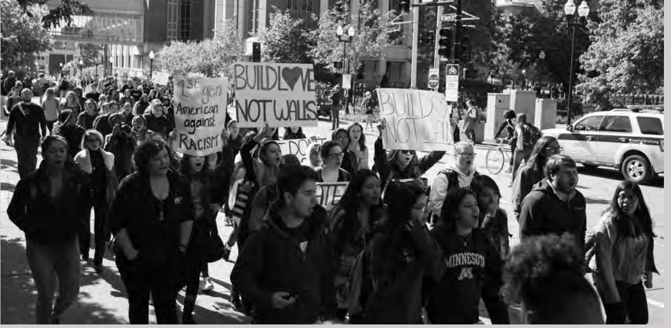
Students march in anti-Trump demonstration

That a campus event may be colored by protests should also not factor into a decision to withdraw an invitation. The university needs to have the integrity to stand by its choice and to embody the idea that divergent perspectives must be allowed to coexist, even if noisily, rather than allowing one point of view to simply shut out others. It is also important to consider that whereas some students may forcefully object to a particular speaker, there may well be others who wish to hear the speaker but have not voiced their views as vociferously. Individuals who are invited to speak and then targeted by protests should resist the temptation to withdraw, allowing hecklers a victory. Understandably, invited guests may find it uncomfortable to be at the center of a speech-related controversy, but to acquiesce in demands that they be silenced will make it easier for other noisy objections to win the day without so much as a fight. Far from a diplomatic solution, the voluntary withdrawal amounts to a form of pressure-driven self-censorship that in its own way restricts the terrain of acceptable speech.