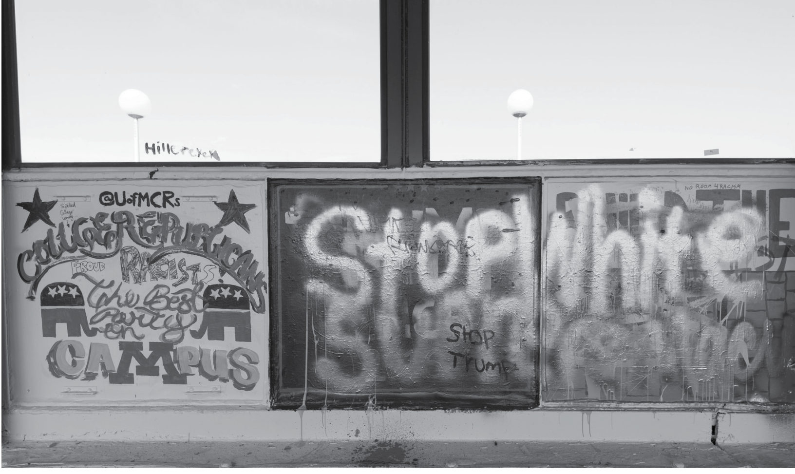
Political graffiti on campus

law professor and vice chancellor for equity, diversity, and inclusion, he said that the cumulative effect of these subtle dismissals was important to bring to the surface: