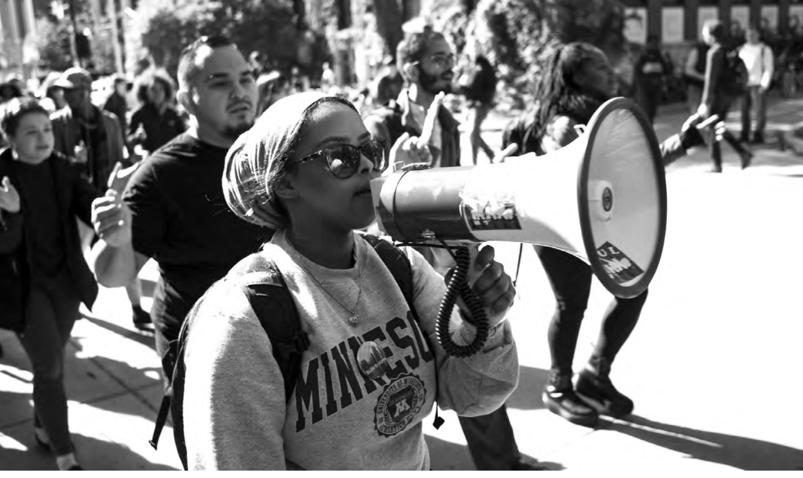
Students march for racial justice

They are asking whether universities that profess a commitment to access for students of color-or what I call "quantitative" diversity—will address demands for improving relational experiences in daily campus life-or what I call "qualitative" diversity.