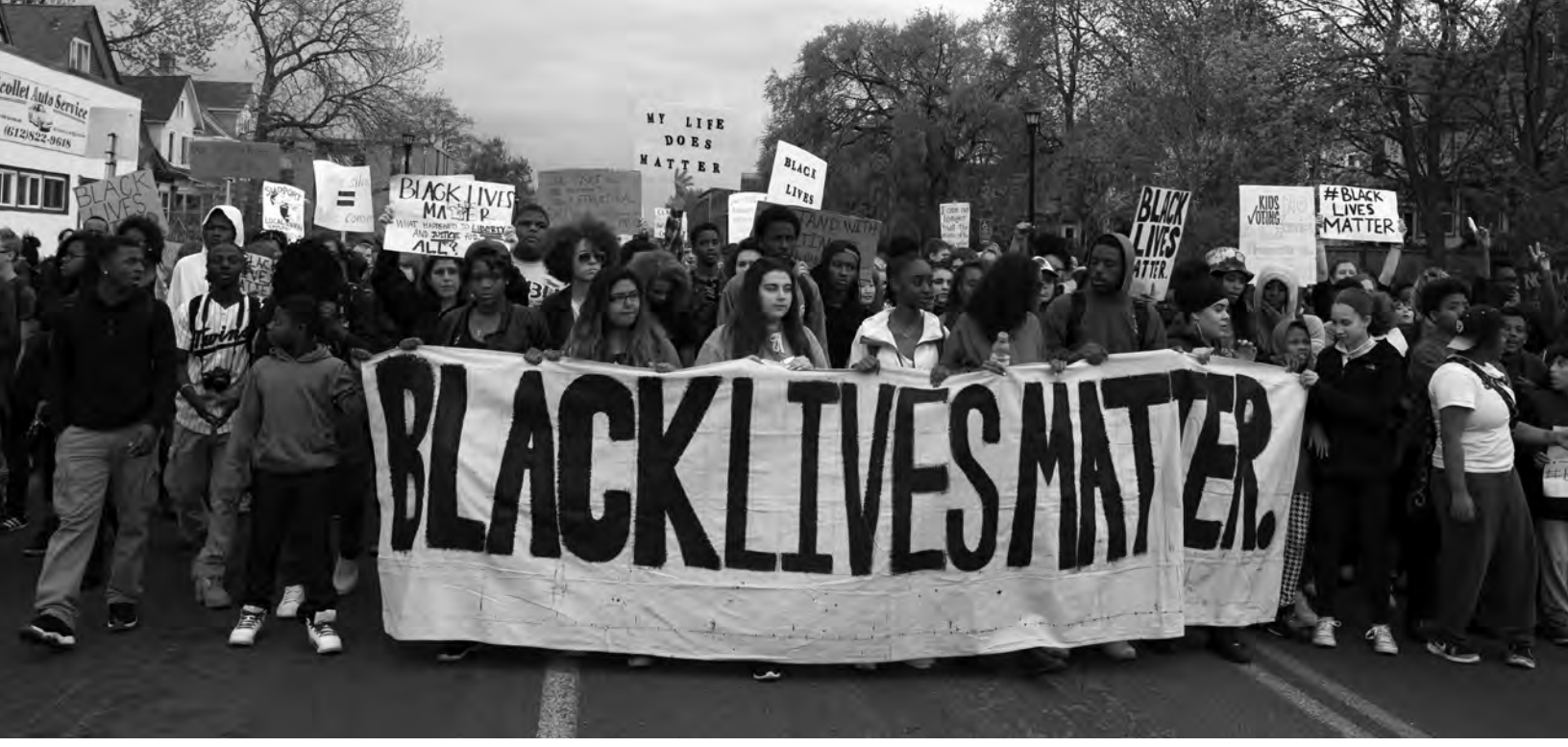
Students march for Black Lives Matter in Minneapolis, Minnesota