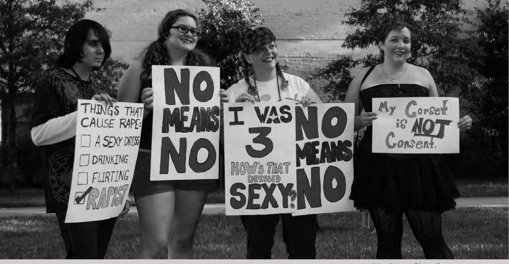
Marchers at Slutwalk in Knoxville, Tennessee to raise awareness for rape victims

Such harm can hamper students' self-confidence, increase anxiety, and hinder academic performance. Fostering education, sensitivity and thoughtfulness among all students and faculty about the challenges and offenses faced by groups that have historically been marginalized can be an honorable part of the university mission.