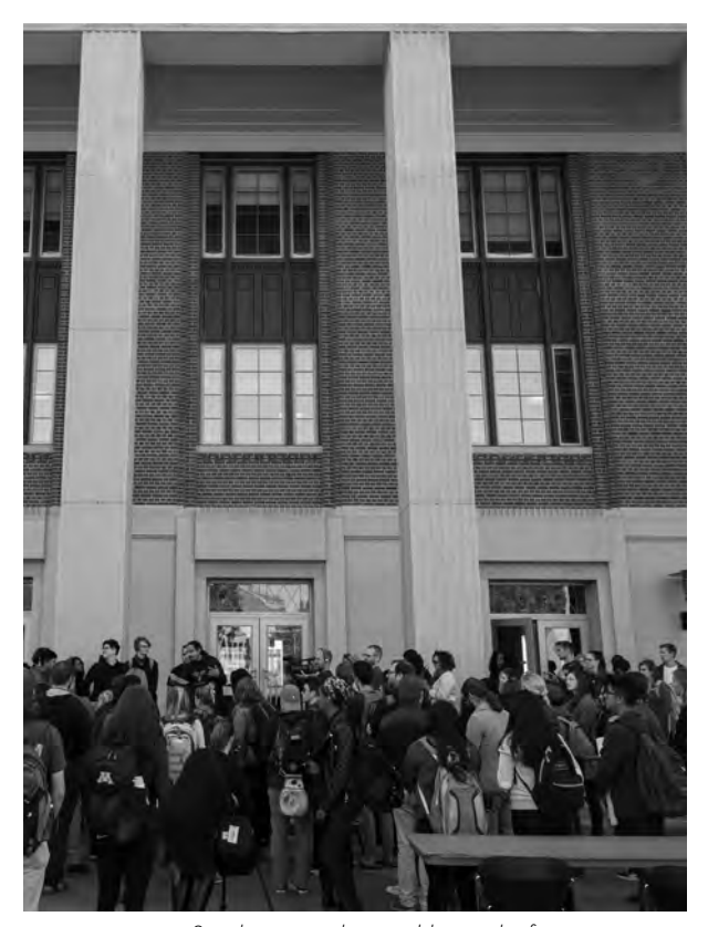
Students gather at library before a protest